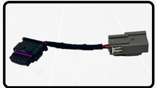
1X ADAPTER HARNESS