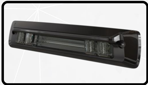
1X 3 RD BRAKE LIGHT ASSEMBLY